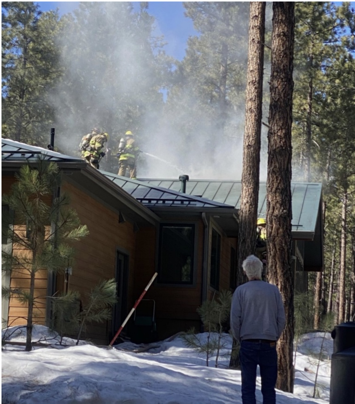
An unexpected chimney fire at a home in Fort Valley in February of this year.