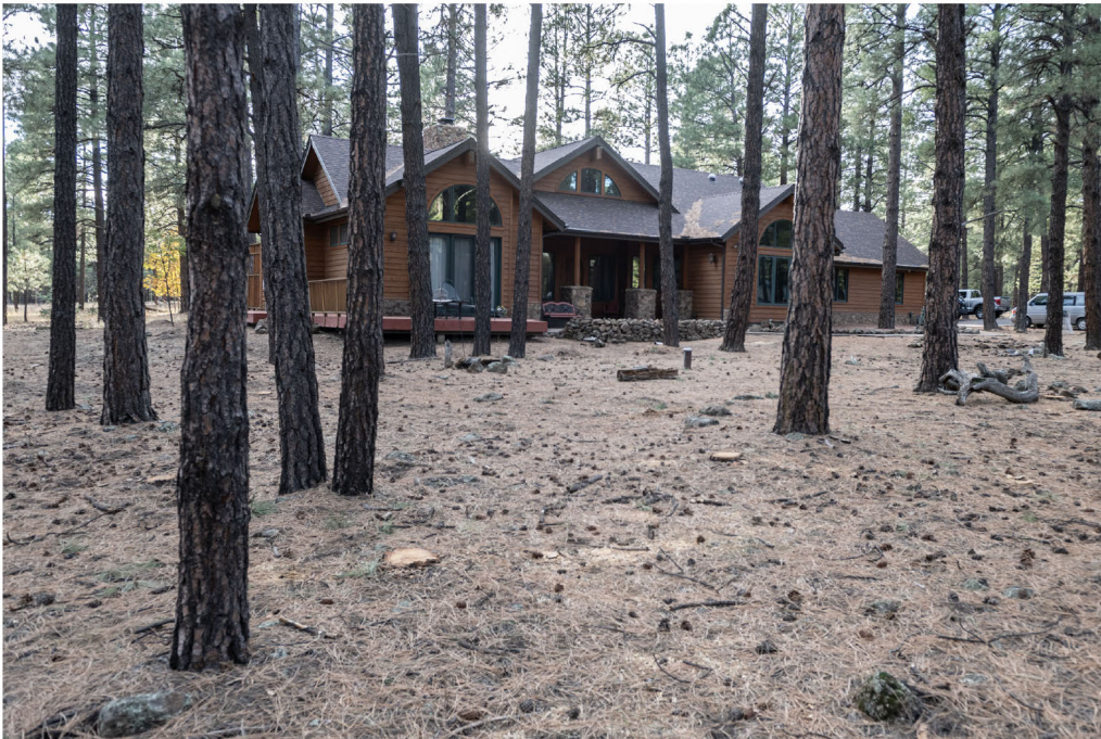
▼ AFTER FOREST TREATMENT