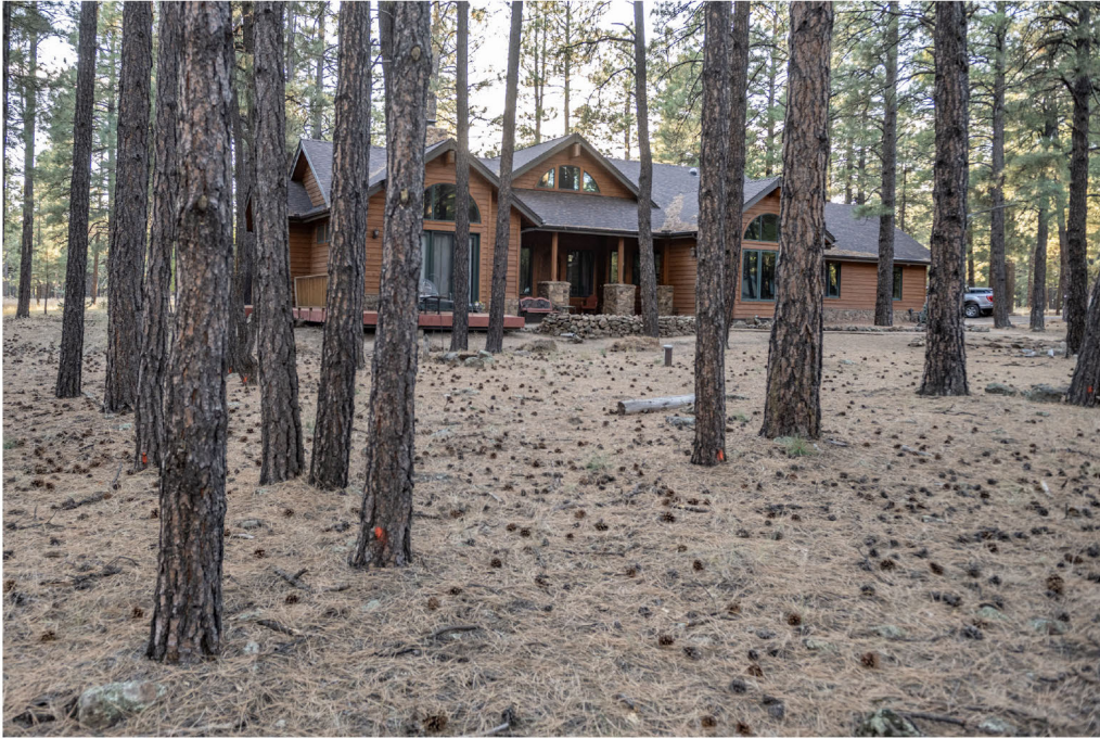
BEFORE FOREST TREATMENT ▲

Gabrielle Billingsly has a property in the densely treed area of Lockett Ranches that recently had some thinning done where over 60 trees were removed. As the pictures below show, these treatments didn't change the overall character of the property but did lower fire risk to the home and will lead to improved forest health for the remaining trees. Gabrielle has offered to show anyone around her property who might like to look at what was done. She can be reached by sending a text message to 703-380-7501.